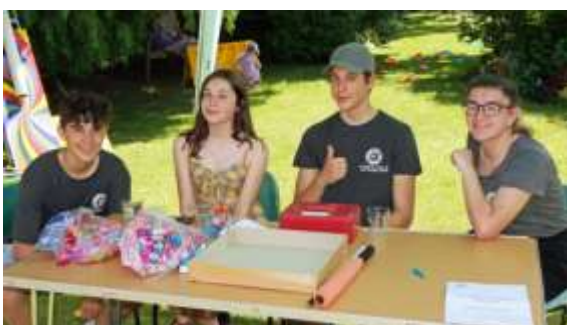
The YUMsters were in charge of the outdoor games