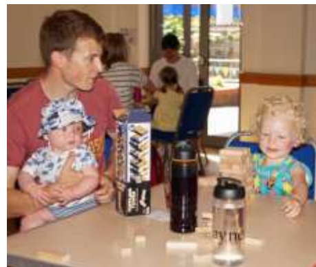
There were a variety of indoor and outdoor activities.