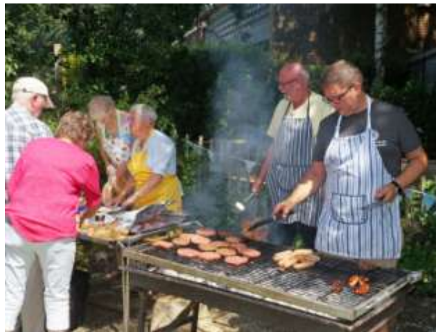
The BBQ was just the thing for a tasty lunch