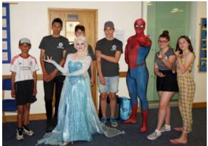
Spiderman and Elsa delighted youngsters of all ages.