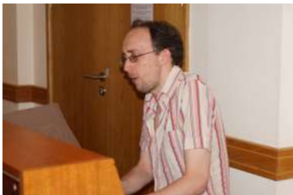
Cream teas and musical entertainment - a perfect way to finish the day.