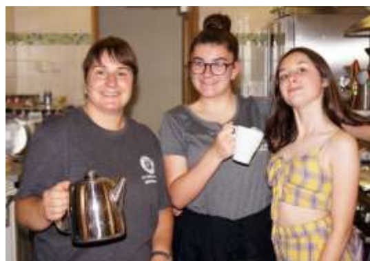
Just some of our wonderful catering folk - always ready with a cup of tea!